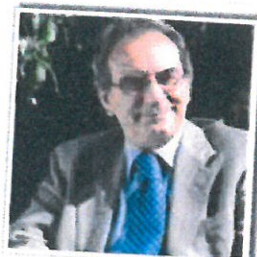
ROMANO DEL NORD

Title of the presentation: "Refurbishment and expansion of monumental hospitals in urban areas: the cultural sustainable approach".